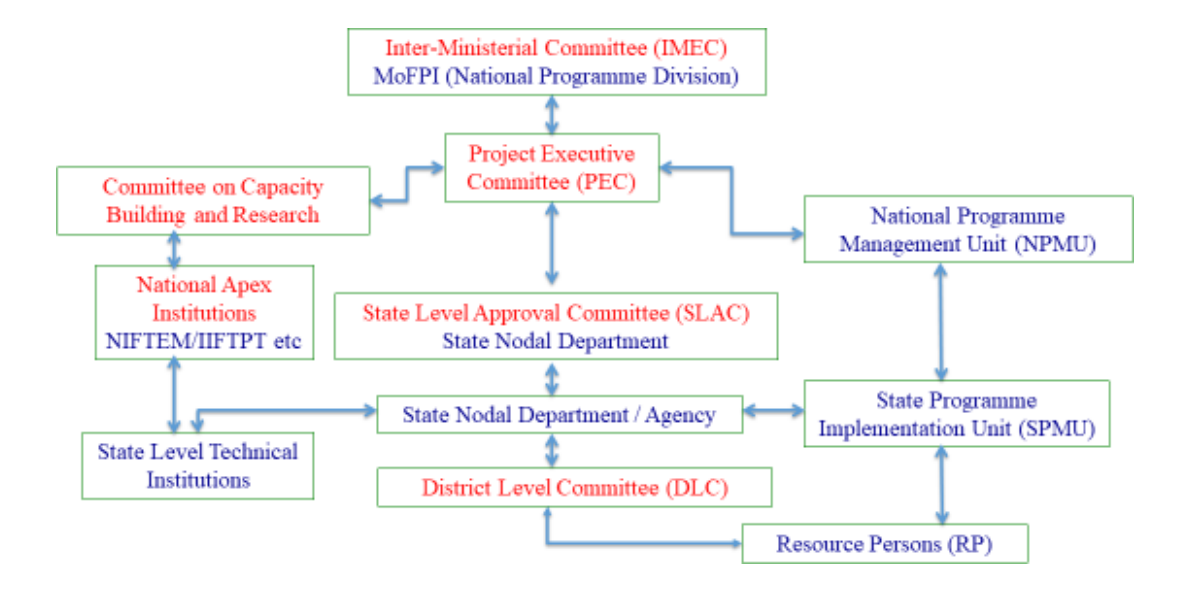
Figure 1: Institutional Architecture

9.1 Robust institutional architecture at all administrative levels would be set up for the scheme. There would be committees at the National, State and District levels (for policy guidance) for implementation and to monitor the progress of the Scheme. These committees would oversee the performance of the National Programme Division at MoFPI and the State Nodal Agencies. In addition to these, there would be PMUs set up comprising consultants and experts engaged on full time basis to support the National Programme Division at MoFPI and the State Nodal Agencies. Institutional structure is illustrated in the chart below and described in the section below: